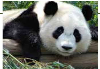
See a Giant Panda at the Atlanta Zoo

Callanwolde Fine Arts Center (404) 872-5338 www.callanwolde.org